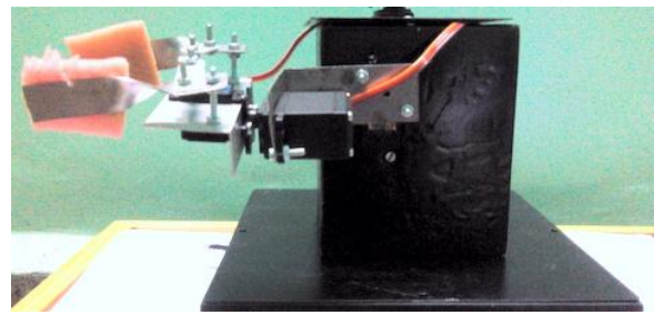
Fig. 3: The robotic arm attached to the aluminium body