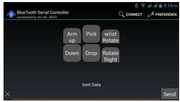
Fig. 5: Bluetooth Serial controller

The Bluetooth serial controller is used to transmit the commands to the FPGA board. The control panel includes 6 different buttons to control the servo motor as shown in the figure 5 below: